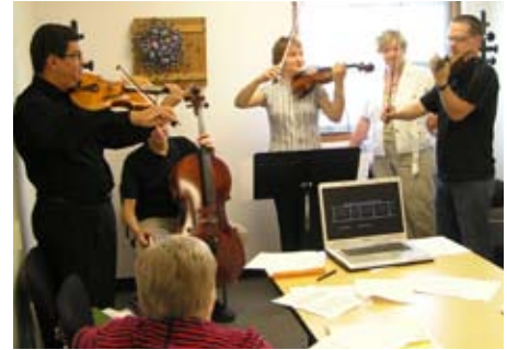
Suzuki Project students present to the Trust.